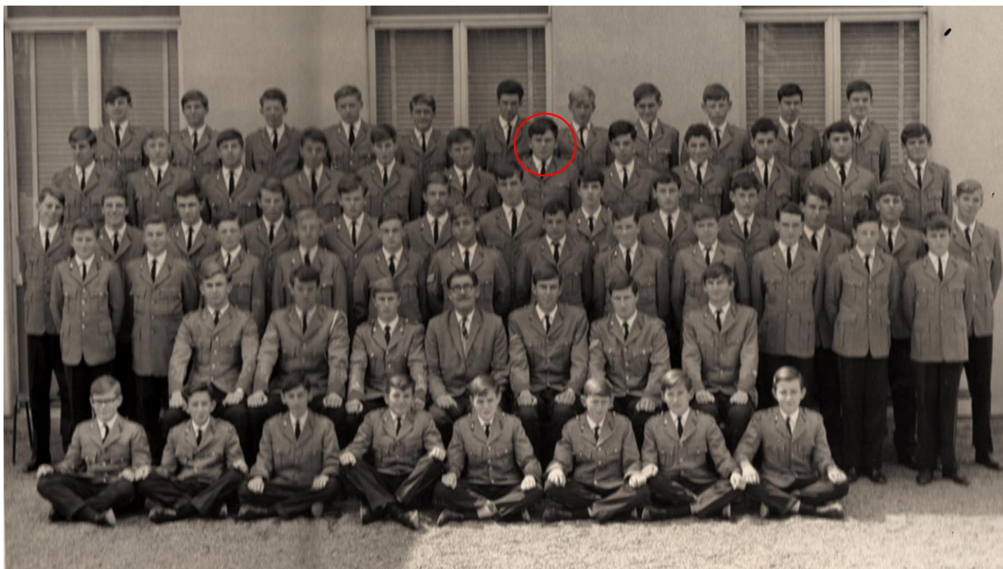
Macquarie House 1966