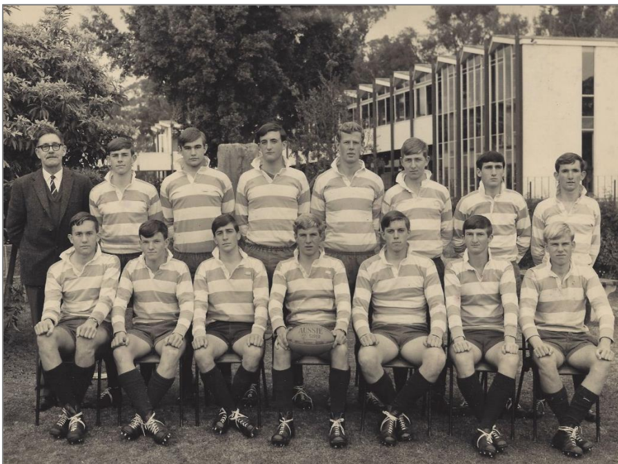
4 th XV, 1967